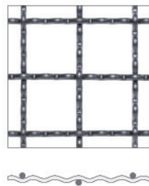
A bord avec picots